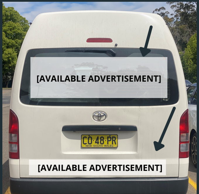
BOTH SIDES OF BUS

Sponsorship / Advertising spaces will be offered on an annual basis (likely July-June), with preferences for long term partnerships.